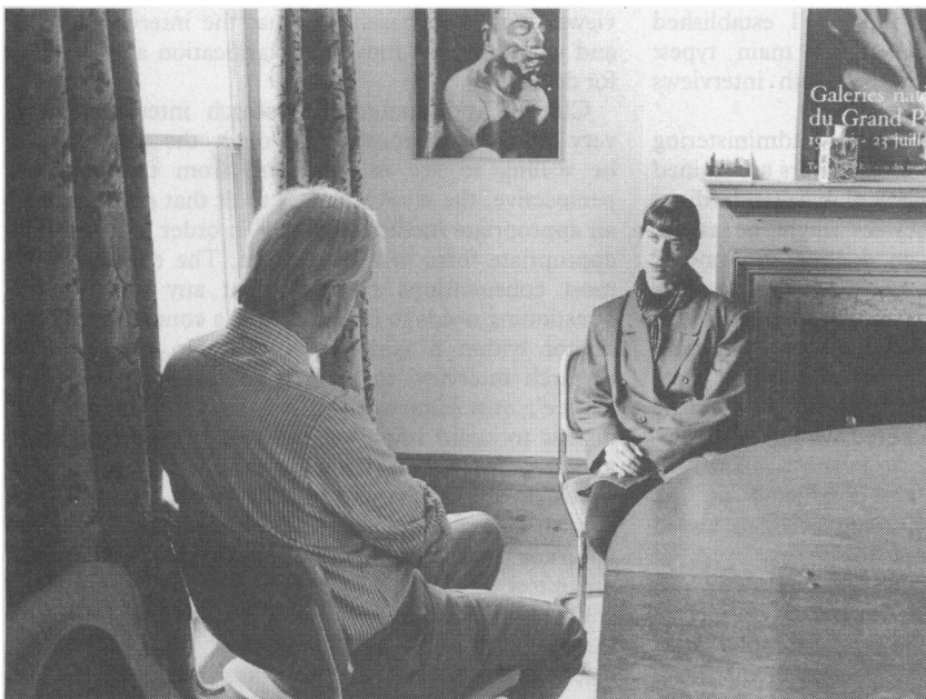
A qualitative research interviewer aims to discover the interviewee's own framework of meanings; the research task is to avoid imposing the researcher's structures and assumptions as far as possible

Qualitative interviews require considerable skill on the part of the interviewer. Experienced doctors may feel that they already possess the necessary skills, and indeed many are transferable. To achieve the transition from consultation to research interview, clinical researchers need to monitor their own interviewing technique, critically appraising tape recordings of their interviews and asking others for their comments. The novice research interviewer needs to notice how directive he or she is being, whether leading questions are being asked, whether cues are picked up or ignored, and whether interviewees are given enough time to explain what they mean. Whyte devised a six point directiveness scale to help novice researchers analyse their own interviewing technique (box 3). 8 The point is not that non-directiveness is always best, but that the amount of directiveness should be appropriate. Some informants are more verbose than others, and it is vital that interviewers maintain control of the